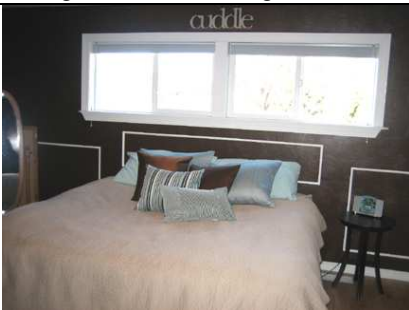
designer master bedroom