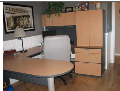
bedroom 3 alternates as an office/study