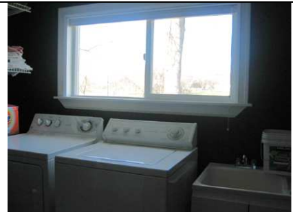
lots of light in the laundry room