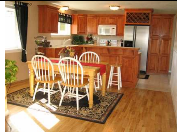
bright updated kitchen

Laundry room with window. This move-in ready home has a NEW heat system, NEW energy-efficient windows, NEW interior and exterior doors, and tons of charm plus a view of the blue bridge from the front yard, and the #17 green to the Tri City Country Club clubhouse in back!