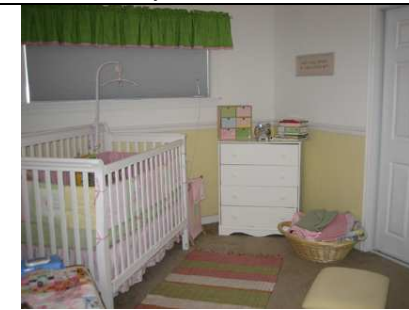
bedroom 1 with traditional flair