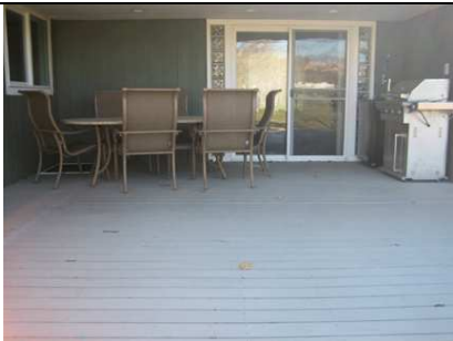
large deck overlooks golf course