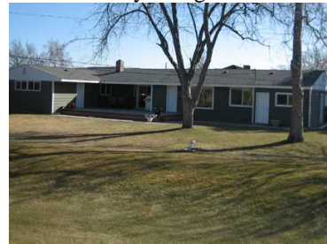
golf course frontage back yard