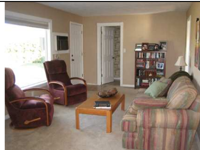
family room off kitchen