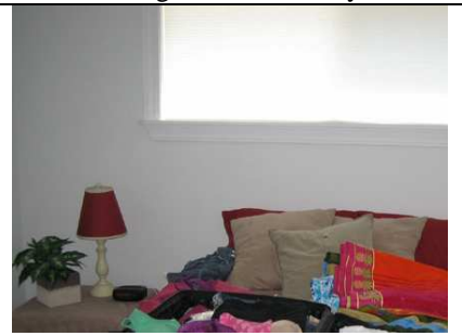
bedroom 2 fills with natural light