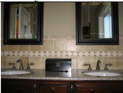
updated master bath